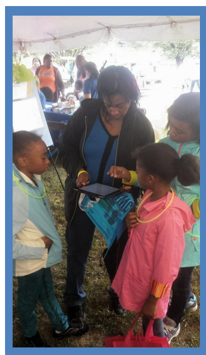
A family takes mental health screenings at the Convoy of Hope's Health Care and Humanitarian Relief Event.

MHA and the American Red Cross launched a partnership between local affiliates of each organization. Interested MHA and ARC affiliates are contacted to help provide mental health services in case of a disaster.