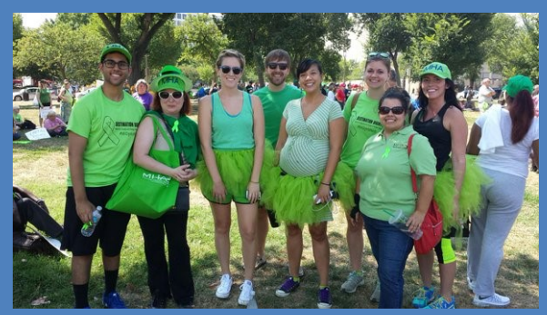
MHA staff joined with over 400 advocates to march on the Capitol.

Throughout the year, the RPC members worked together to impact state legislation and regulations across the country.